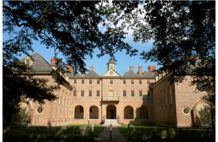
Beautiful college campus of William and Mary

We would like to invite you to attend the 2013 GSICS Annual Meeting to be held March 4-8, 2013 in the York Room at the Sadler Center on The College of William & Mary campus in historic Williamsburg, Virginia, USA. Beautiful Williamsburg is internationally known as the premier center for the preservation and interpretation of American colonial history, as well as home of the nation's premier small public university: The College of William and Mary.